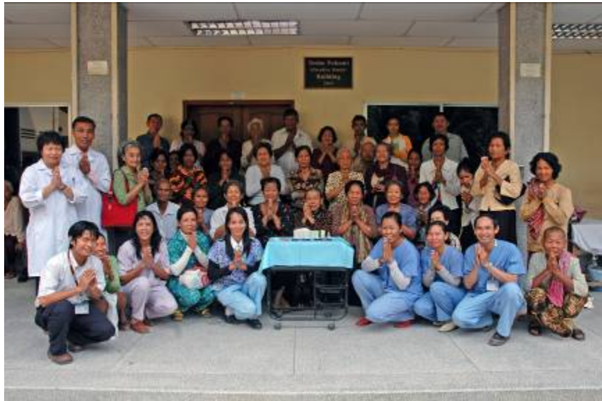
Cambodia – Diabetes Clinic with insulin donated by IFL